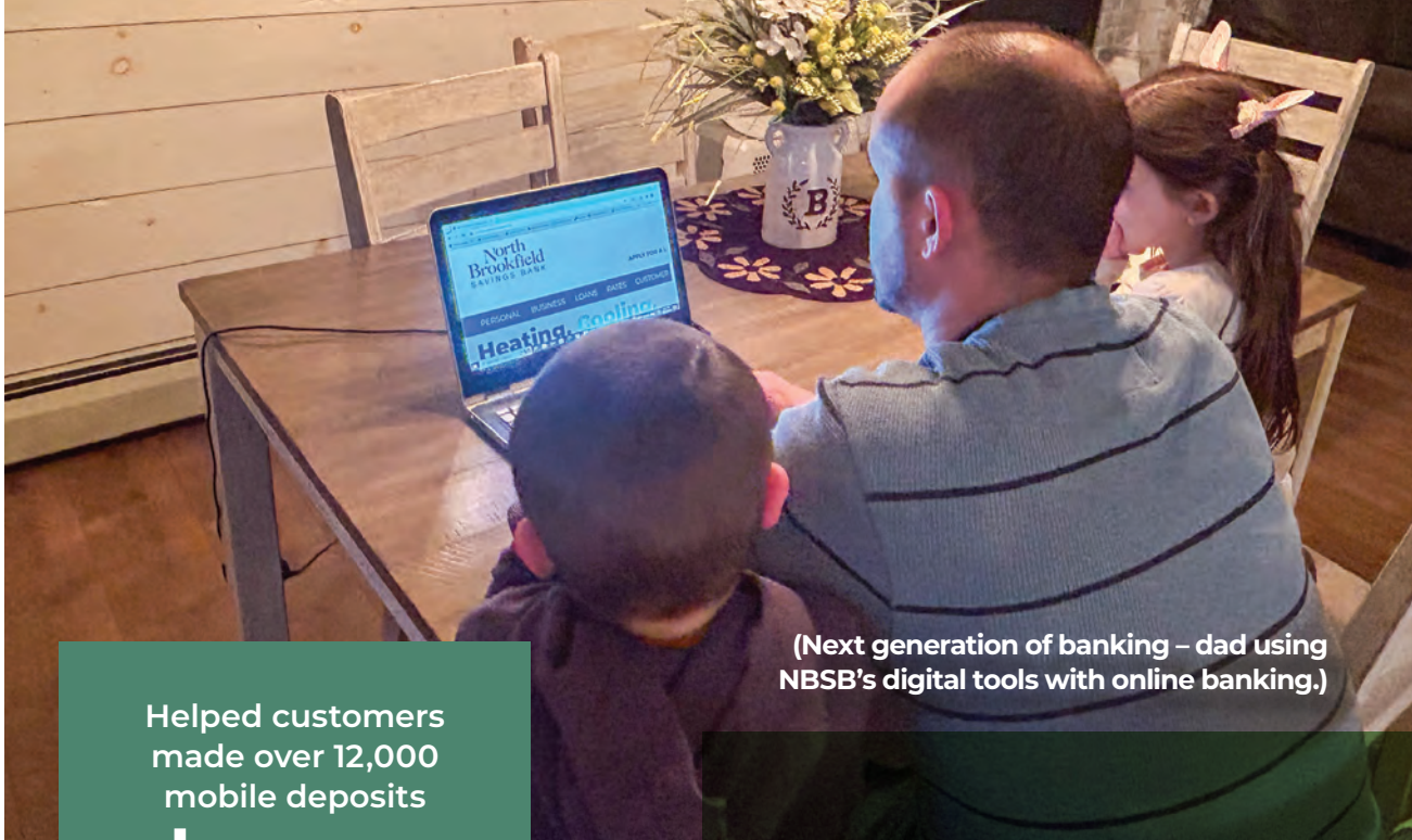
(Next generation of banking – dad using NBSB's digital tools with online banking.)

Helped customers made over 12,000 mobile deposits